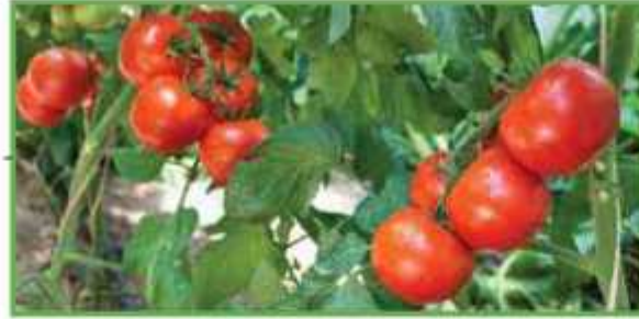
HERBS & VEGETABLES PLANTS