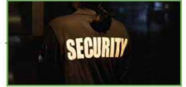
SECURITY, PRIVACY & SAFETY