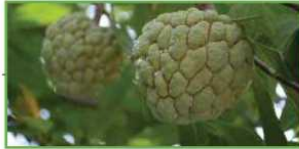
MINI FRUIT ORCHARD