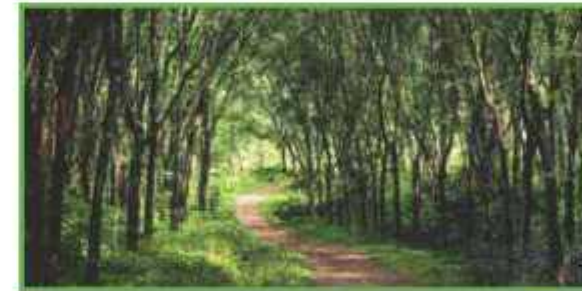
MIYAWAKI 'ECO' FOREST IN OXYGEN PARK 3, BARHA