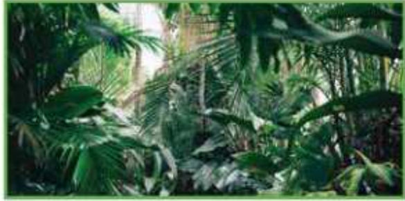
EXOTIC HIGH DENSITY PLANTATION