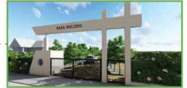
ENTRY GATE WITH FENCING