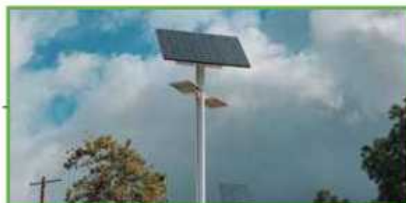
SOLAR STREET LIGHTS