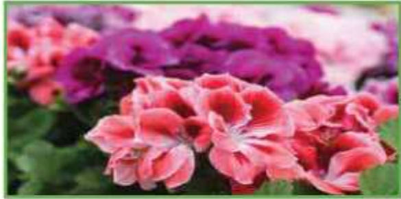
AROMATIC FLOWER GROVES