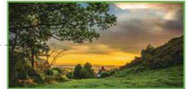
GREAT VIEWS OF NATURAL SURROUNDINGS