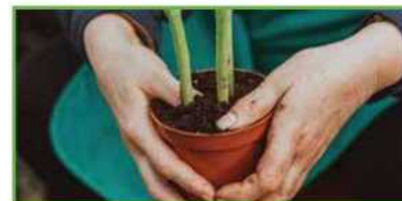
GUIDANCE OF EXPERT HORTICULTURIST